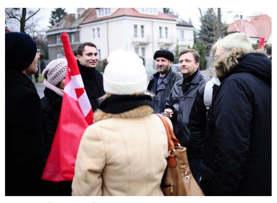
Zmiana at the anti-Turkey protest in Warsaw.